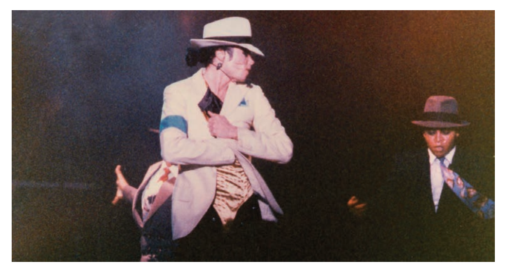
Michael Jackson live "Dangerous Tour" in Monza (Italy) 06/07/1992.

Michael Jackson's Thriving Estate Makes it a Target for Extortion Attempts_- Continued Page 5