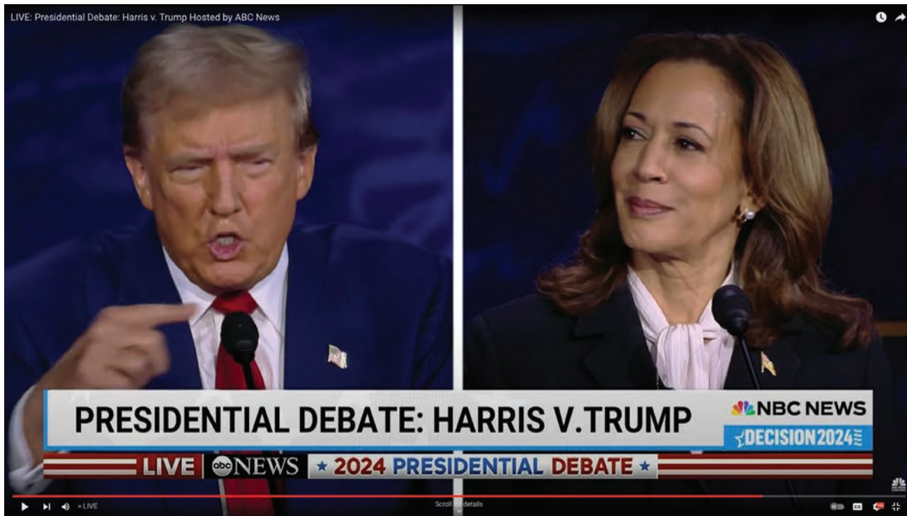
Former President Donald Trump and Vice President Kamala Harris during their first presidential debate Philadelphia on Tuesday night.