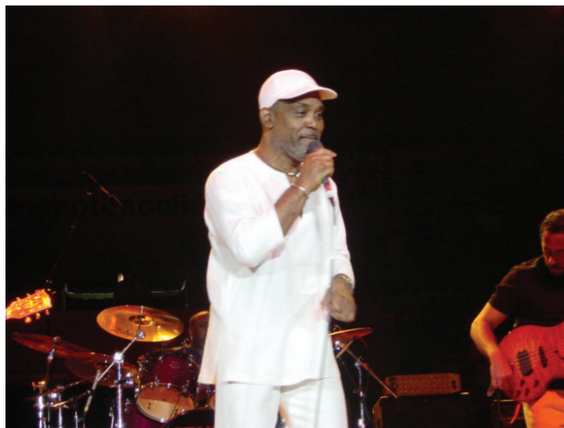
Frankie Beverly (2002).