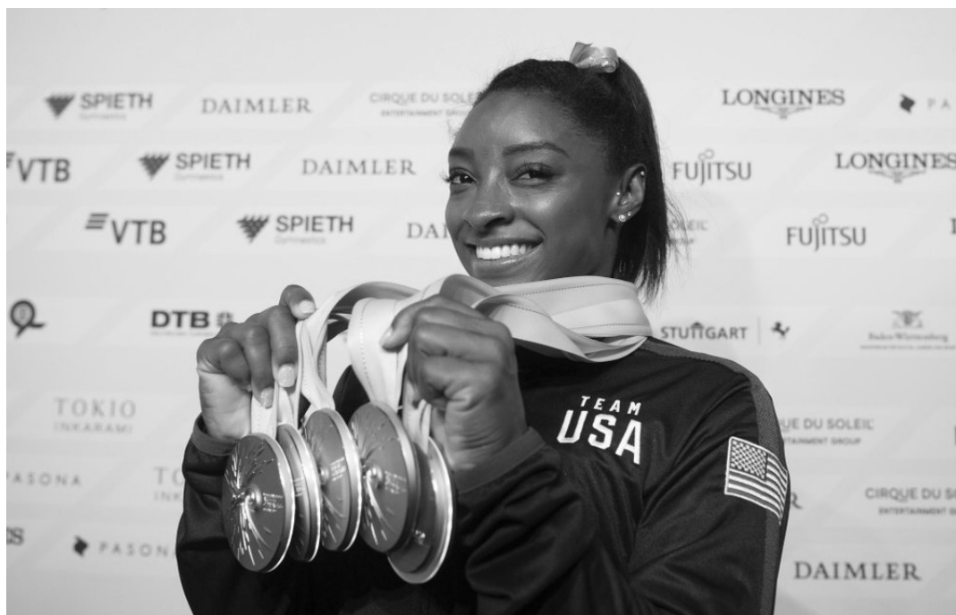
Simone Biles of the United States shows her five gold medals she won at the Gymnastics World Championships in Stuttgart, Germany, Sunday, Oct. 13, 2019.

Thomas Bach said Sunday that Biles' star status would make gymnastics a must-see event at the Tokyo Olympics.