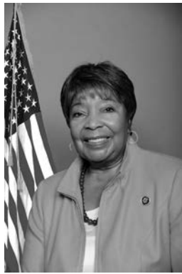
By Congresswoman Eddie Bernice Johnson

Were he alive on October 12th, Dorie Miller, the Waco, Texas-born naval hero would have celebrated his one hundredth birthday. His selfless heroic deeds for our nation on December 7th, 1941, when he was only 23-years-old, will live in history forever!