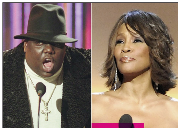
This combination photo shows Notorious B.I.G., who won rap artist and rap single of the year, during the annual Billboard Music Awards in New York on Dec. 6, 1995, left, and singer Whitney Houston at the BET Honors in Washington on Jan. 17, 2009. Houston and the Notorious B.I.G. are among the 16 acts nominated for the Rock and Roll Hall of Fame's 2020 class.