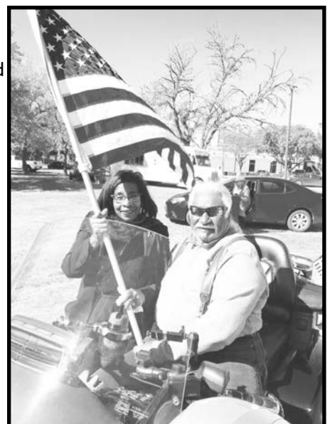
District 4 VETERAN PARADE

"Oorah". "Oorah" to the Honorable Council Lady, District 4, for bringing us all closer together as a community. Reminding us that all news is global. Next Week: JROTC Wilmer Hutchins and Veterans