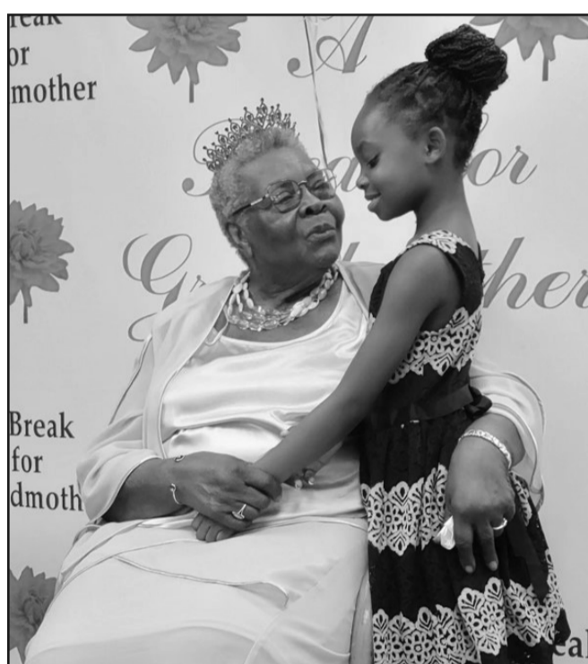
88Year Old Raising an Eight Year Old.

It is no secret that grandparents... have been the first choice for childcare, permanently or part-time when parents could not fulfill their lawful and loving obligations. It was quite the norm. We coined a new generational term when 'single mothers' started paying for reasonable daycare while raising their children with grandparents just filling in the gaps. We recognized quite easily the 'sandwich generation', which is three generations in a home.